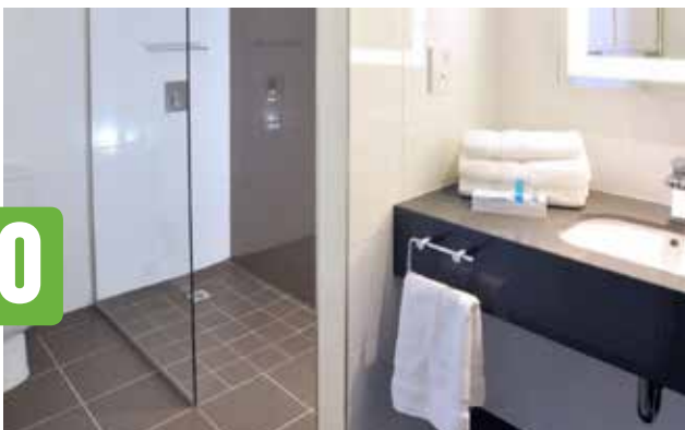
Spacious bathroom layout with maximum circulation space