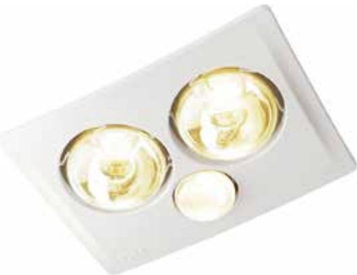
Combined heat, light and steam extraction system