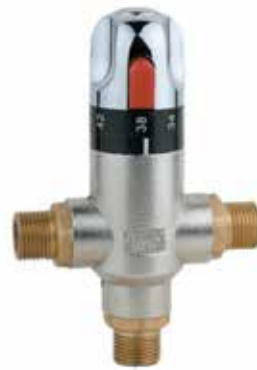
Thermostatic temperature control