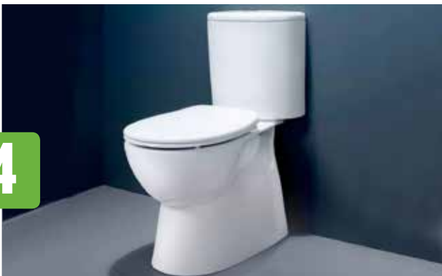
An accessible toilet suite (taller than standard suites)