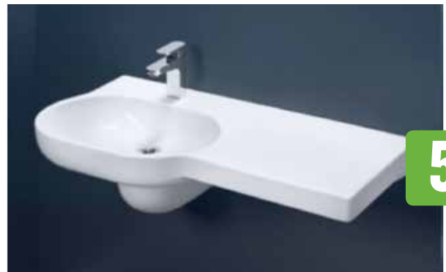
Recessed or wall mounted basin with clearance underneath