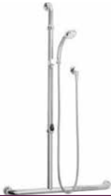
A height adjustable shower hose and rail system